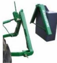
Smart hitch male & female