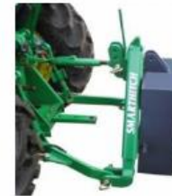
Smart hitch connected