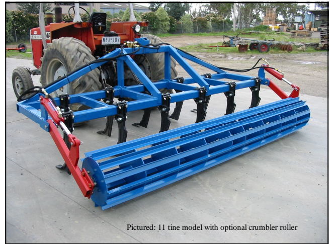
Pictured: 11 tine model with optional crumbler roller

“Eliminates soil compaction, reduces soil erosion, improves microbial activity around the root zone and increases water absorption and retention”