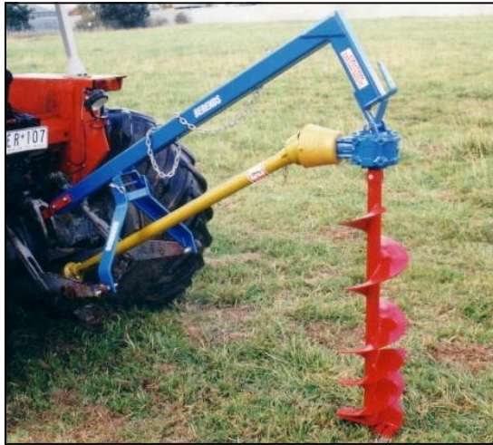
Standard Model with 12" Auger