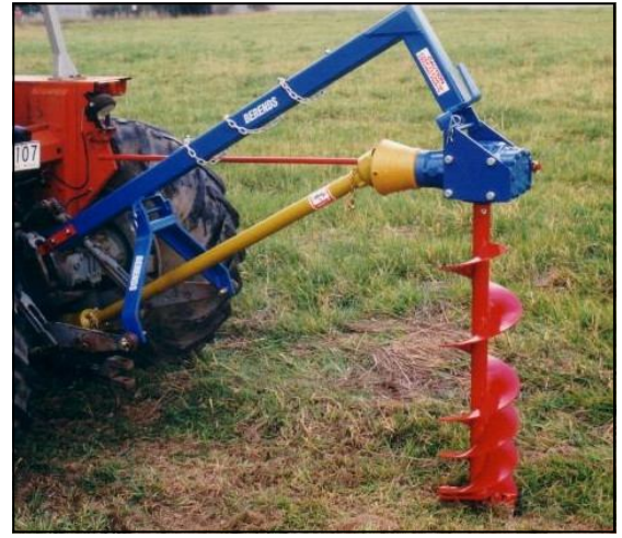
Heavy Duty Model with 12" Auger